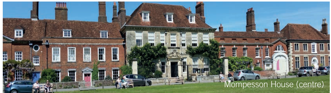
Mompesson House (centre)