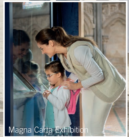
Magna Carta Exhibition